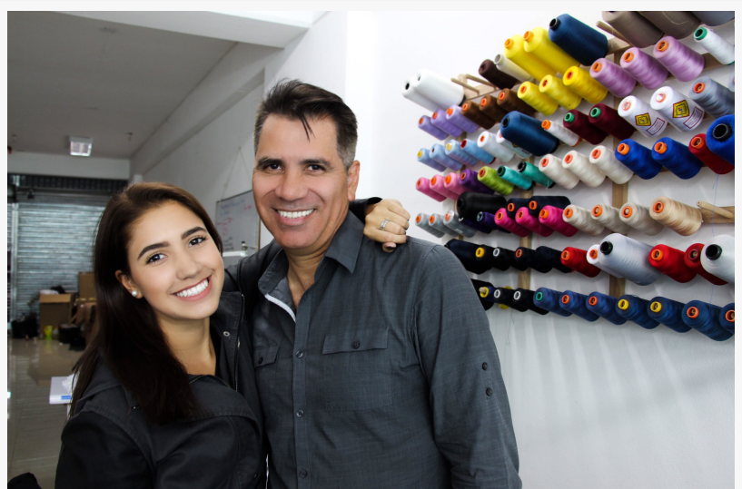
Daughter and Father, the founders of TriOwl, Clothing with a Purpose