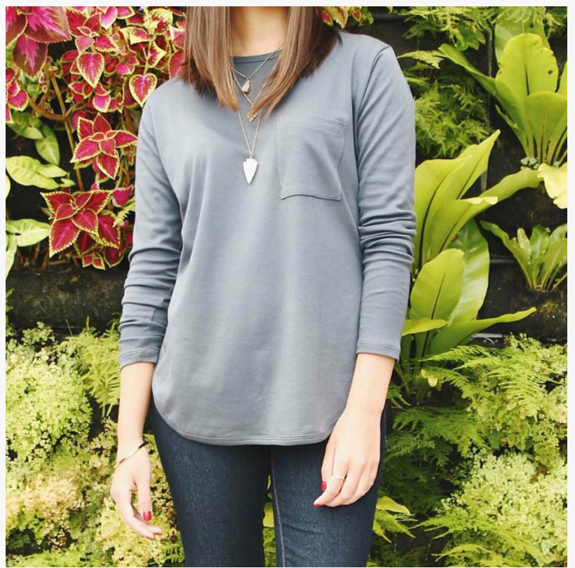
Made with 100% Peruvian Pima Cotton