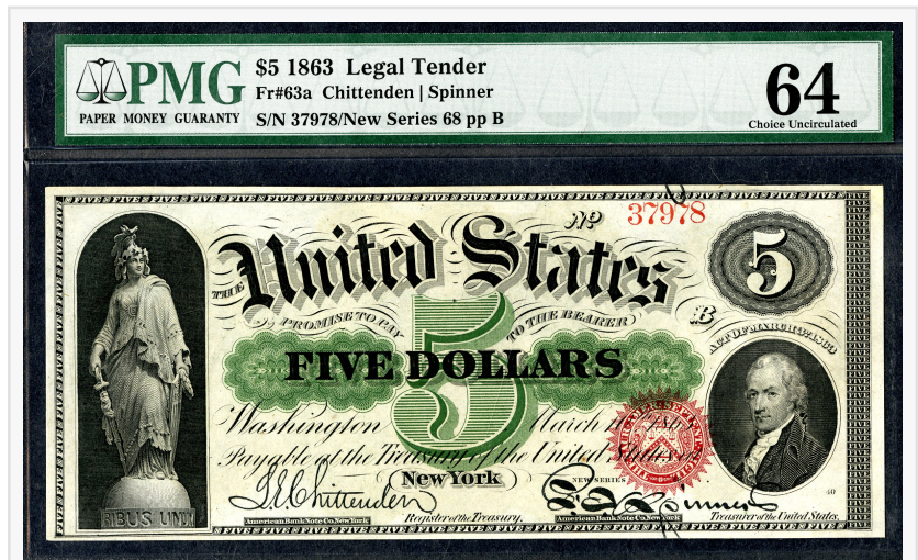
Fr. 63a. Chittenden-Spinner signatures. Nice and bright. Well centered. PMG Choice Uncirculated-64

The auction includes over 80 lots of U.S. & World scripophily; over 20 lots of checks, drafts exchanges and fiscal paper; 33 lots of Security printing ephemera highlighted by an extremely rare and desirable British American Bank Note Company advertising sheet ca.1860's (est.$3000-6000); Over 50 lots of Colonial banknotes from the Harry Rinker Collection that will include many multiple lots from New Jersey and Pennsylvania. Colonial highlights include a New Jersey 1786 banknote pair of 3 Shillings and 30 Shillings (SCWPM S1855, S1859, est. $750-$1,500). Following the colonial notes will be an