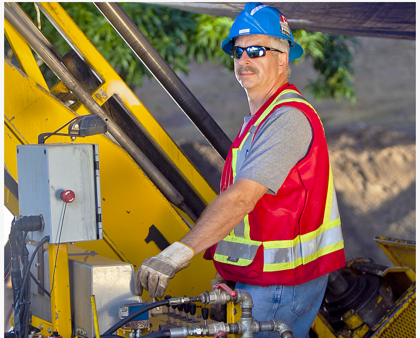
Safety in the Workplace - PPE's, Great Light - and Cool Surroundings