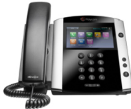
Polycom VVX 600