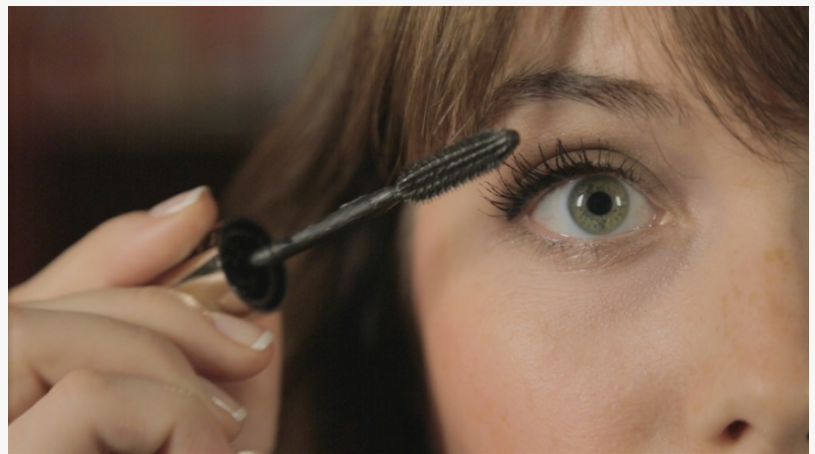
Anti-Street Harassment PSA