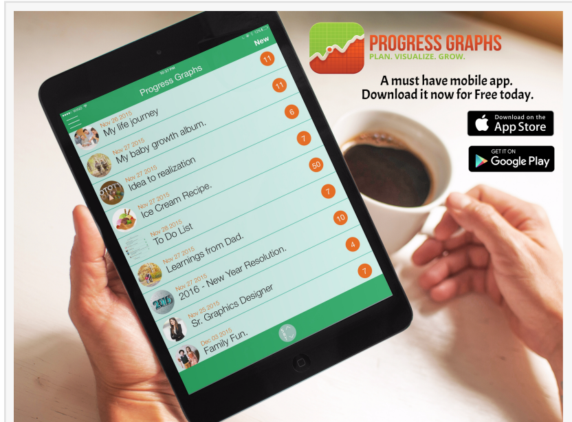
Example usage of App

The app starts where typical "To Do List" apps lead off, by allowing user to create segregation of