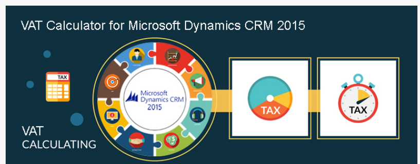
VAT Calculator 2015