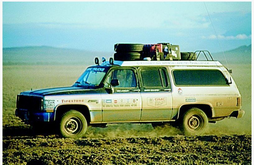
Sowerby's record-setting Suburban truck crossing the Serengeti in southern Kenya in 1984.

The book is a colourful collection of 50 short stories chronicling Sowerby's