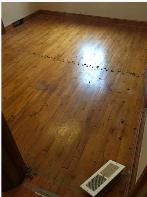
Fix Your Wood Floor with A Top Notch Wood Floor Refinishing Contractor

Avoiding name brands of products to be used is another concerning tactic of cheap labor. You want to