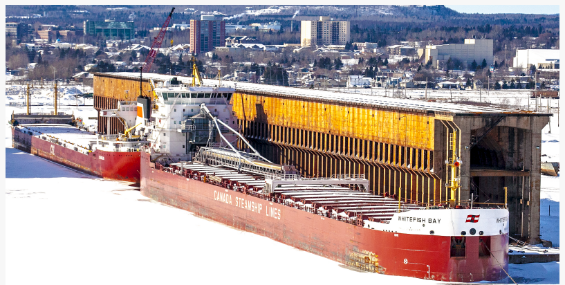
America's Top Mining Photographer Kevin Palmer