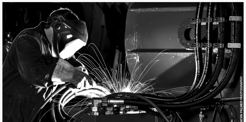
America's Top Mining Photographer Kevin Palmer