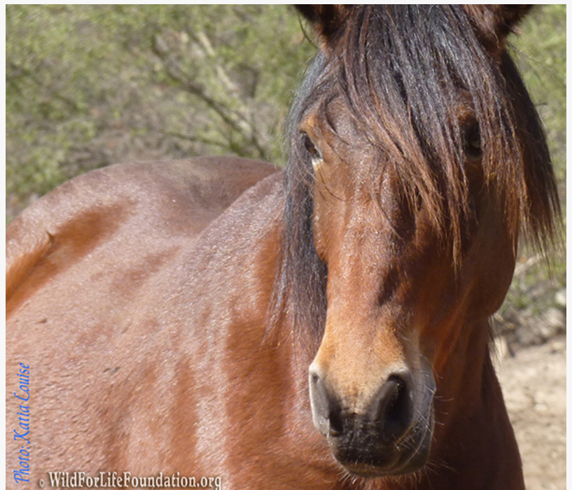
Protecting and Preserving America's Horses

There are over 200 million acres of range-lands in the U.S. where these horses could roam freely, but they are quickly being eliminated by the same governmental agencies that claim to