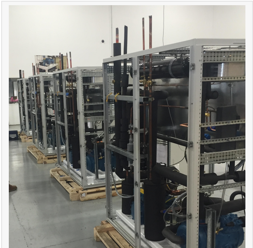
C1 Recovery System production line

US Cryotherapy provides various cold air treatments to its clients to enhance their general wellness and improve