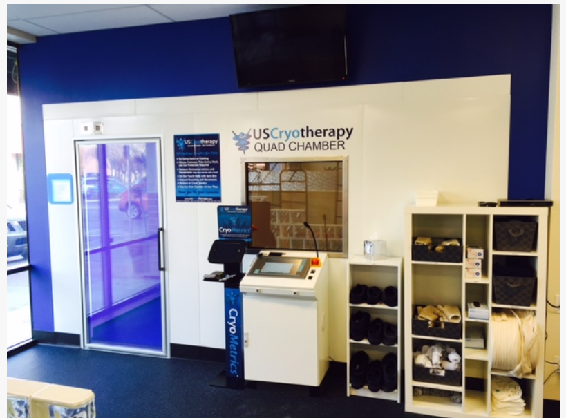
US Cryotherapy Davis center