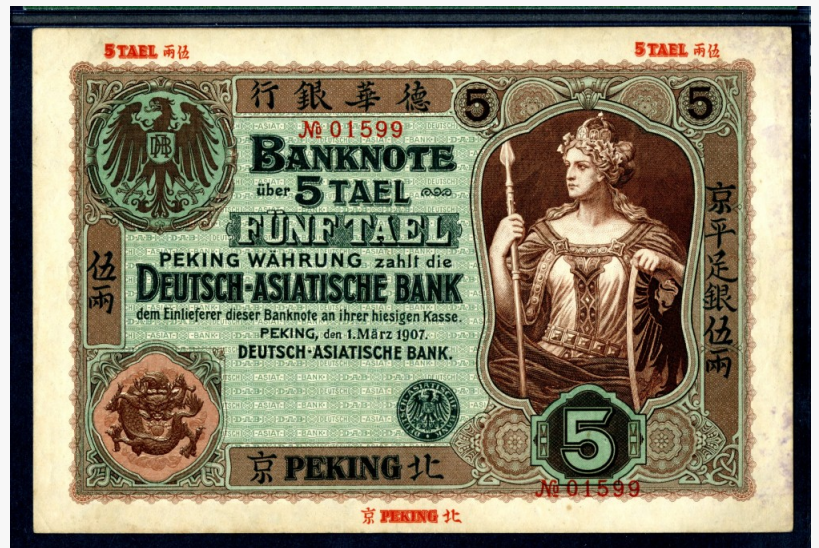
Peking, China. 5 Taels, P-S280r S/M#T101-11b, Remainder Banknote, Black and brown on light blue undertint, Germania at right, back same colors with facing Germania cameo's on left and right, S/N 01599, PMG graded About Uncirculated 55. Amazing note rarely