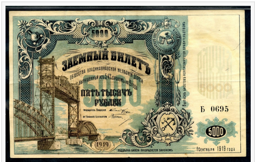
Russia, 1919, 5000 Rubles, P-S598, Issued banknote, black on blue and salmon underprint, railroad bridge at left, back with large map, S/N B0695, PMG graded Choice Very Fine 35 NET with note of small tears and stains, extremely rare note. This is the first

Session I, on Monday, April 11th, will begin with world banknotes, featuring the Silicon Valley collection of worldwide banknotes. French Colonial notes are highlighted in the collection and will include a French Guiana, 1961, 500 Francs graded Gem Unc. 65; two denominations of the Government of India, 1957 and 1959; and “Persian Gulf Note” issue notes boasting high grade.