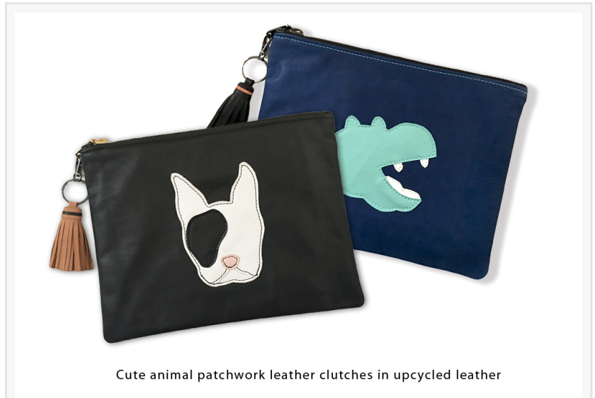
Cute animal patchwork leather clutches in upcycled leather