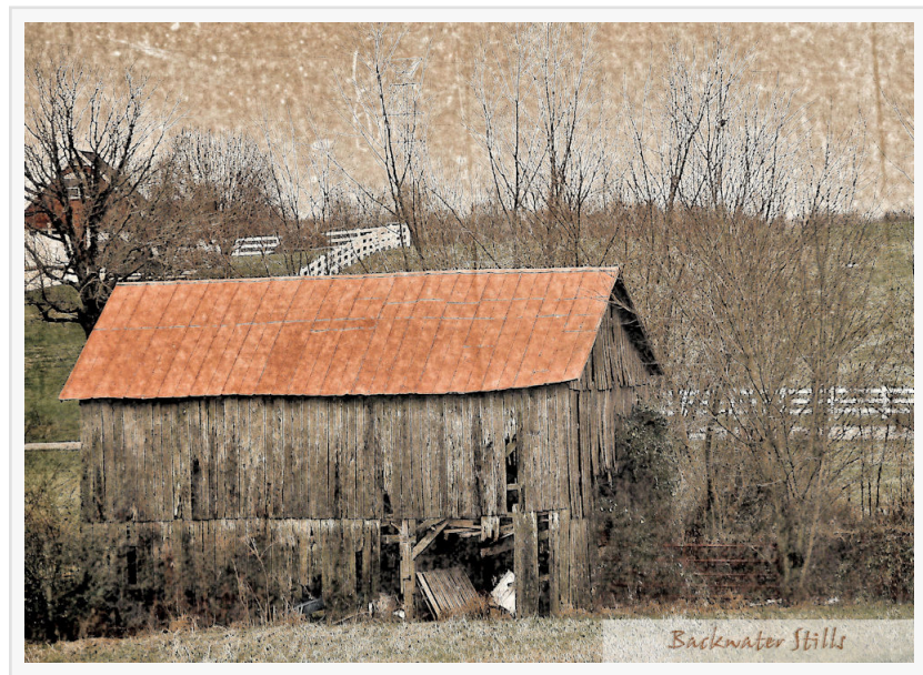
Hot Tin Roof is part of The 2016 Barn Collection

All barns have a story to tell, and the barns in this limited run collection are no exception. Each photo print is a conversation piece that comes with its own distinct narrative. Barn lovers will be introduced to traditional barns that provide a splash of color against an otherwise monochrome landscape, rusty metal barns with cows to watch over, and barns with a sense of playfulness. "I try to give the barns a personality, even if I