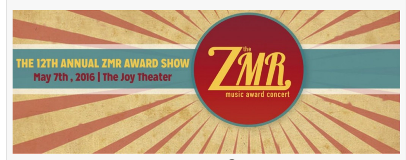
ZMR Awards Banner: May 7th @ The Joy Theater

and has included over 60 recordings. He is known for his meditative style which blends elements of Eastern and Western music, as well as his mastery of a multitude of ethnic instruments and continued exploration of new frequencies and resonances.