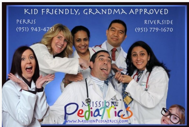
Mission Pediatrics Inc. Team being silly