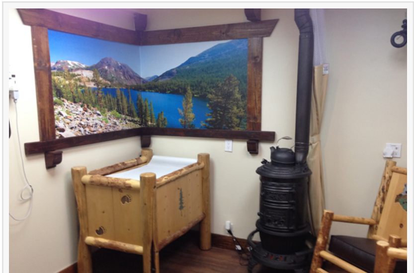
Mission Pediatric's Riverside Office

To provide high-quality, whole-person pediatric care with emphasis on excellence and compassion. To actively promote healthy living, healing and overall improved patient health to include the under-served patients in our community and beyond. To combine the art of good medical teaching with humor and cheerfulness such that both the provider and the patient are satisfied.