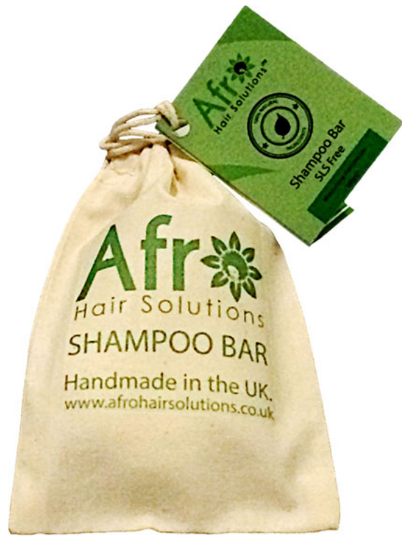
A shampoo that won't strip your hair of oils