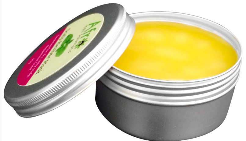
Scalp Reviver Mask prevents itchy scalp