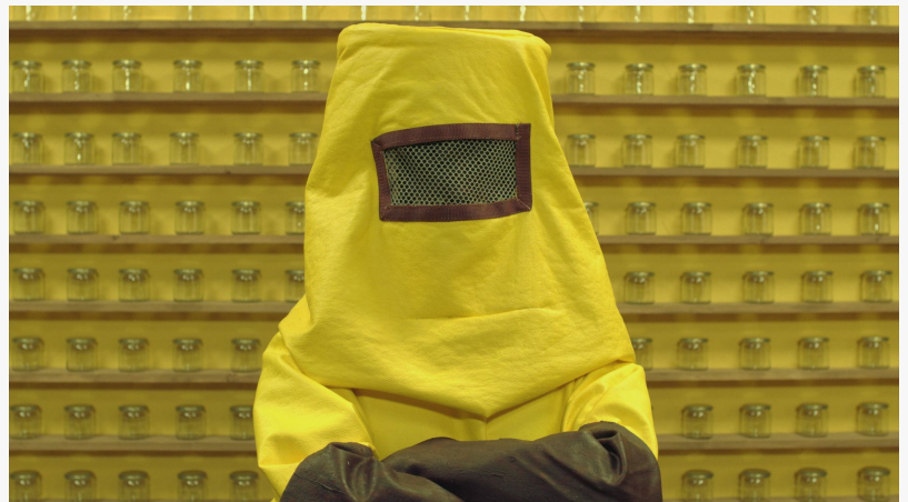
The Fantastic Love of Beeboy & Flowergirl