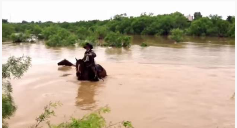
Horses and animals are impacted by all forms of disaster