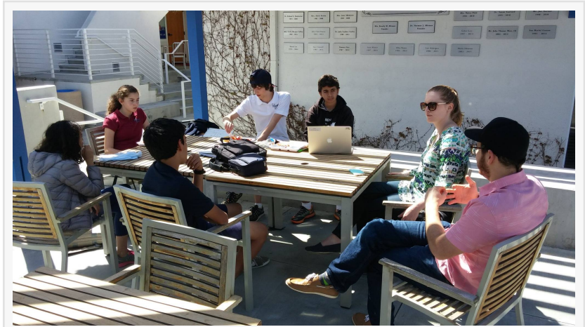
"A Different Pair of Eyes" meets with filmmakers from Zemma Productions for advice on their production schedule.