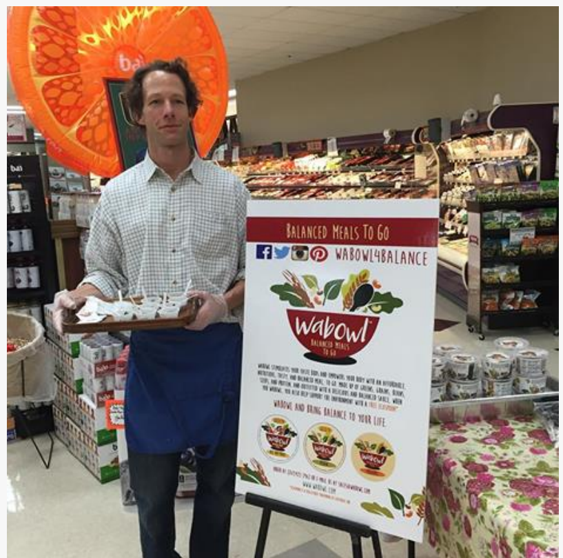
Sampling at the Pennington Quality Market

Your community supermarket, where quality, service and selection are always available, every day of the week. Here at the independent, family-owned Pennington Quality Market, our focus is providing all sorts of top-quality food and specialty items.