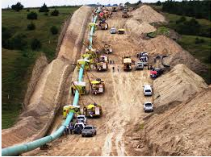
Clearcut area would exceed the width of Interstate I-64 for 600 miles

Fact: Dominion's ACP will not be located "within just a few miles" of Nelson County's major tourism destinations. Dominion proposes to build the pipeline within feet of the only entrance and exit to