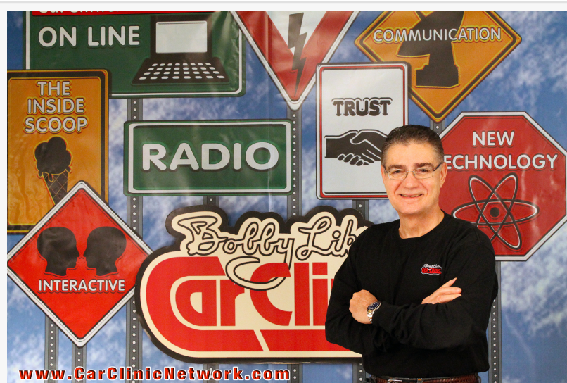
Automotive Expert & Car-Talk Host