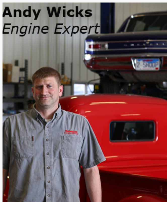
Owner & Founder of DynoTune Speed & Performance