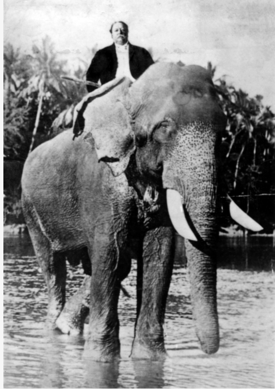
William Howard Taft atop an elephant