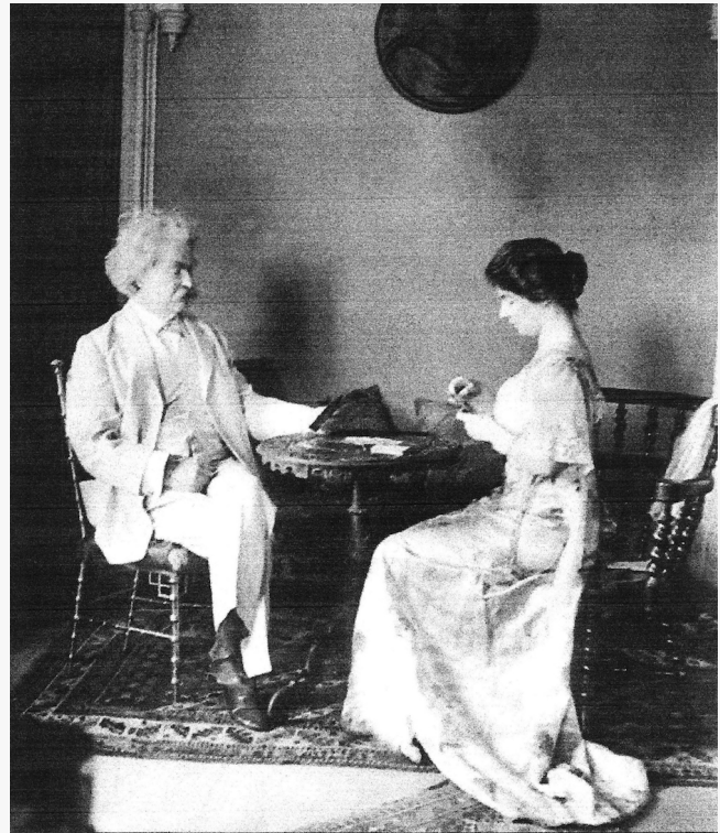
Mark Twain & wife Playing Cards