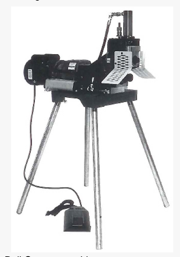
Electric Roll Groover machine