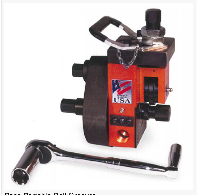
Pace Portable Roll Groover

The PACE 1039 Mini-Mite<sup>™</sup> self-contained portable Roll Groover is two tools in one. It features rugged construction with a larger top roller bearing, heavier top slide, and more material in the housing to make for more durability. And all hex drives on this robust unit are 15/16" so one wrench fits everything!