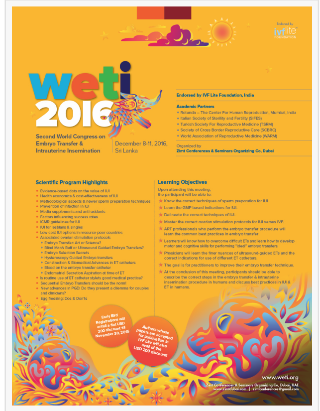
Second World Congress on Embryo Transfer & Intrauterine Insemination

The main Meeting at the Heritance Ahungalla, South Sri Lanka, will have two halls running simultaneously; in one all aspects of Intrauterine Insemination will be discussed threadbare & in the other hall, the focus will be exclusively on Embryo Transfer & its role in Assisted Conception. The main objective of this Meeting is to give an updated overview on all aspects of Intrauterine