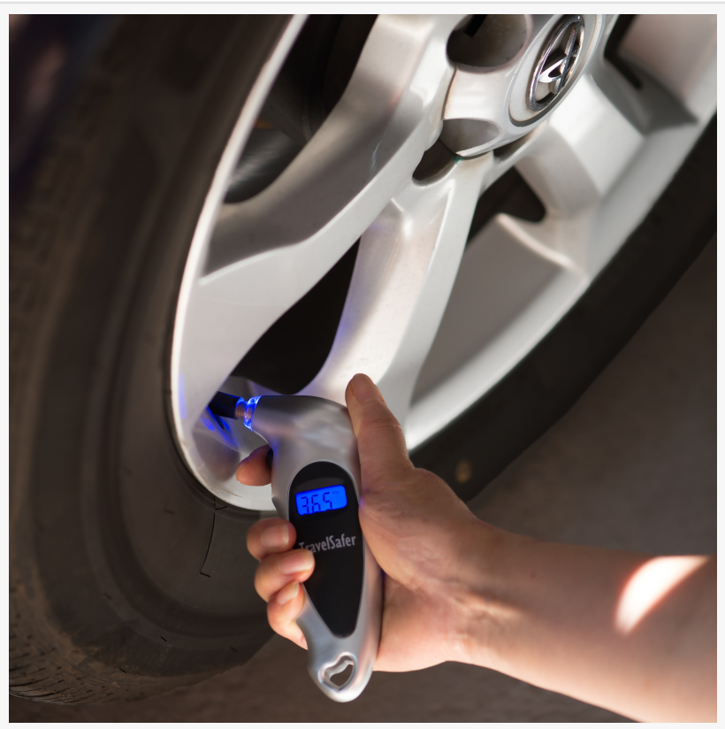
Checking tire pressure saves lives

The Travelsafer Digital Tire Pressure Gauge is sold with a 100% satisfaction guarantee. To find out more information about the importance of monitoring tire pressure, visit their page directly at <a href="https://www.amazon.com/dp/B00SO4OVIQ">www.amazon.com/dp/B00SO4OVIQ</a>