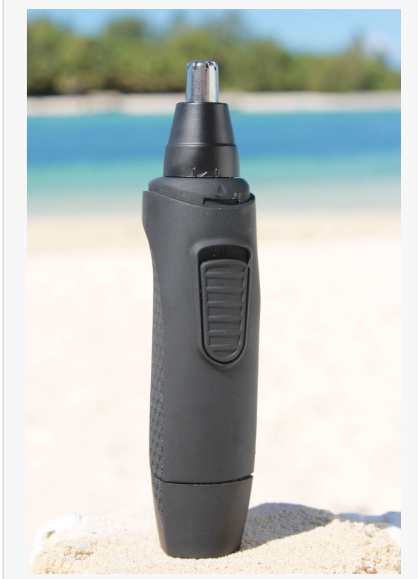
Launch of Nose hair trimmer from Muri Beach Rarotonga