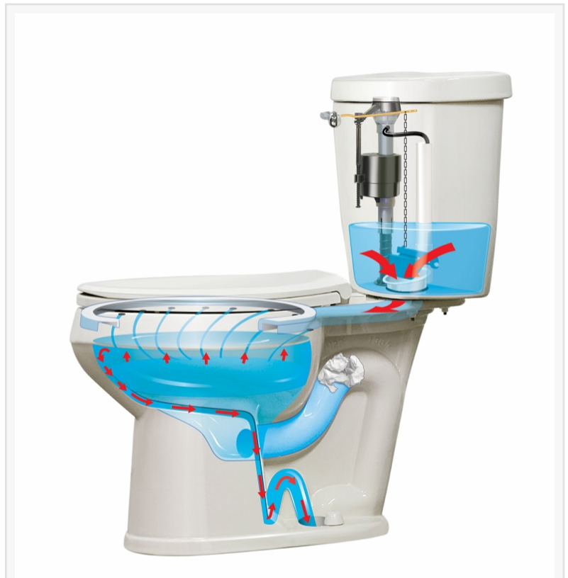
Protector No-Overflow toilet from Mansfield Plumbing.

Summit toilets all feature the Mansfield three-bolt tank-to-bowl SmartFasten™ system to prevent leaking and rocking, plus high performance MagnaFlush™ flushing technology. The toilets can flush 1,000 grams MaP and come in three low water consumption options: 1.6 Gpf, 1.28 Gpf and a dual flush of 1.1/1.6 Gpf.