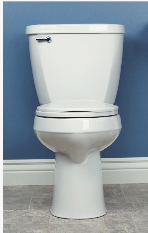
Summit toilet with PuraClean easy-clean surface from Mansfield Plumbing.