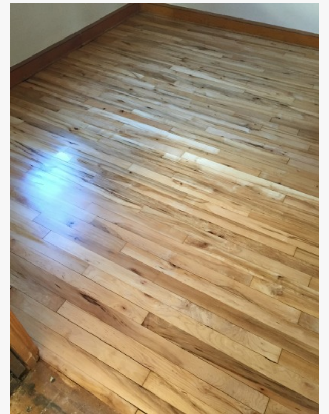
Royal Wood Floors Hard Wood Flooring Specialists

ers and avoiding subcontractors - to ensure that a project is well-done and financially viable."