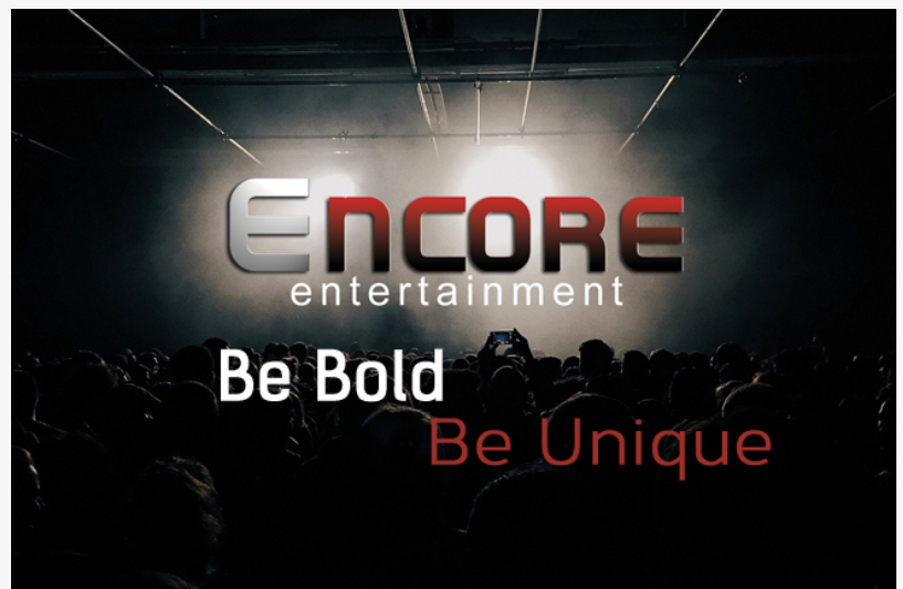
television and web video content unit