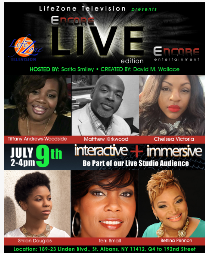
Gospel & Christian music tv series

Encore Entertainment will to tap into the passionate and loyal Gospel & Christian audience with empowering, immersive and entertaining programming. This is all