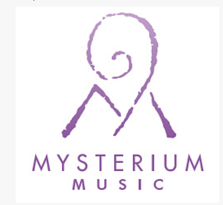
Mysterium Music is donating 50% of July album sales to Cancer Support Community