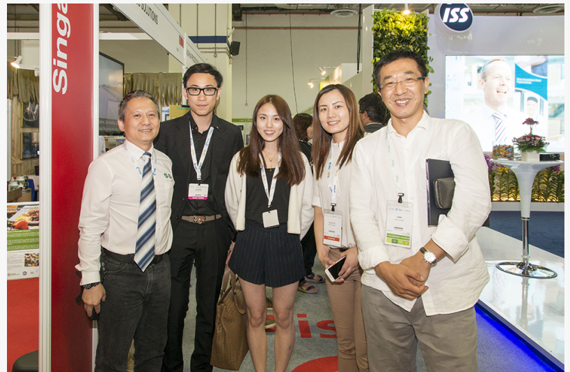
APS and Richland Biotech Team Water treatment Collaboration

By harnessing the power of organic bio-organisms, good bacteria help break down unwanted waste, thus purifying water and restoring the canals' ecological balance. No chemicals or large equipment are necessary to facilitate the process or conduct maintenance.