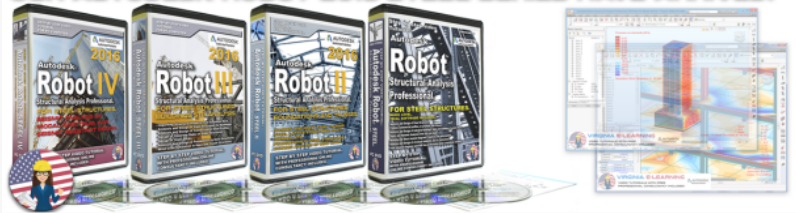
Virginia E-learning Autodesk Robot Tutorials

OUR AUTODESK ROBOT 2016 STEEL SERIES HAVE ARRIVED!