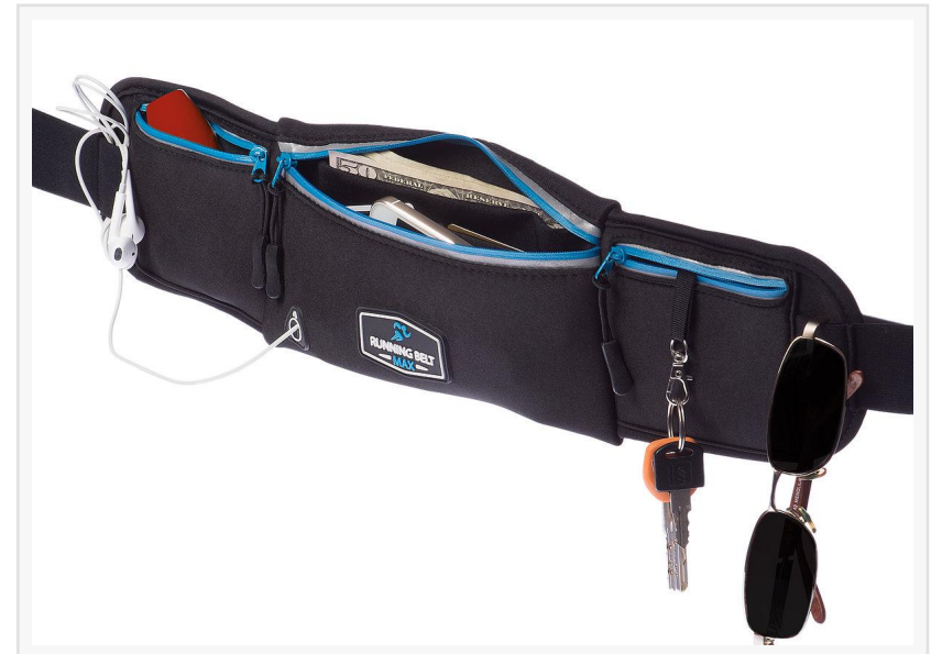
The Running Belt Max is very versatile

"One of the reasons our running belt is selling so quickly, is it's not just runners who are using our belt— much to our surprise. People from all walks of life are enjoying the Running Belt Max, from