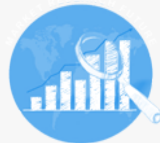
Market Research Report

Zinc sulphate is a very versatile compound and has wide range of applications in various industries such as healthcare, pharmaceutical, agriculture, chemicals and others. Zinc sulphate is mostly used as a medicine in healthcare industries in order to prevent the zinc deficiency in a