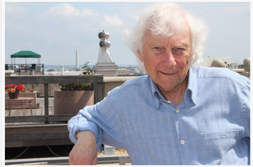
Author Joe Rothstein

The Latina President is the work of author Joe Rothstein, who spent more than three decades masterminding political campaigns for candidates at all levels of government. Many of the most influential senators, members of congress and state leaders.