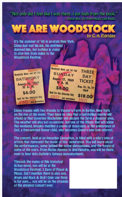
Back cover showing original Woodstock tickets

This press release can be viewed online at: http://www.einpresswire.com