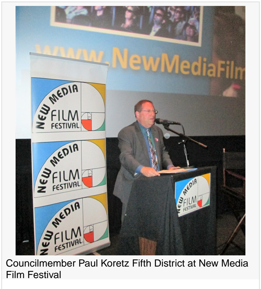
Councilmember Paul Koretz Fifth District at New Media Film Festival

The New Media Film Festival is one of the most unusual yet exciting festivals in the world. New Media Film Festival embodies the transformative power of the cinematic arts as it effectively welds together story and technology for everyone. It is inspiring to think about how new media is rapidly changing the