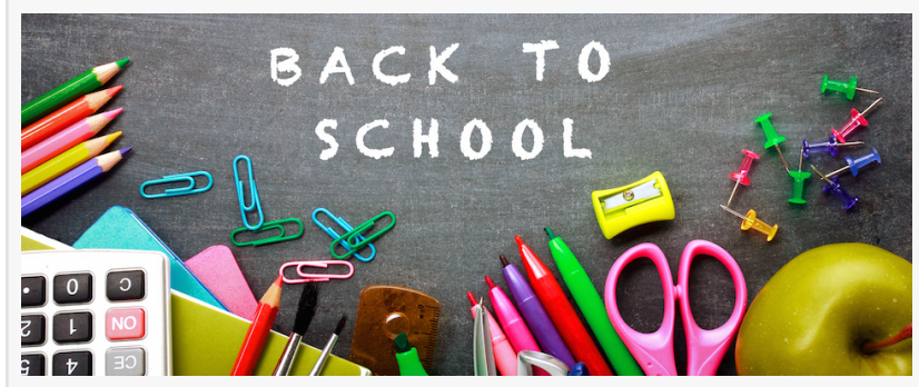
Autism Back to School Bash, Aug. 14th

for all attendees. It will take place on Sunday, August 14th from 1:00-3:30pm at Pearl Studios in Midtown, Suite 1204.