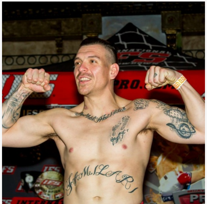
IFS Middleweight and No. 1 Contender

This press release can be viewed online at: http://www.einpresswire.com