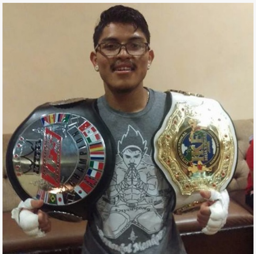
IFC and IFK Champion