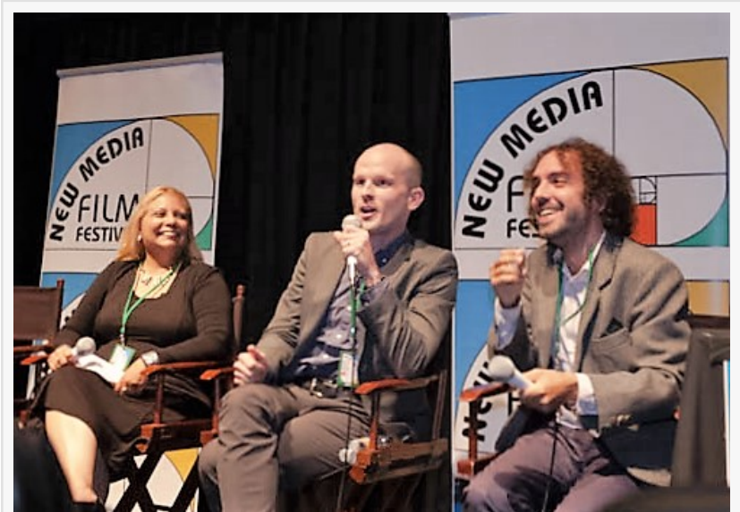
Technology Panel at New Media Film Festival

So you have to be in the trenches, learning the medium and wait because there's money to be made but there's not a lot on the content side. There's a studio and there's a bunch of shingles. Do you want