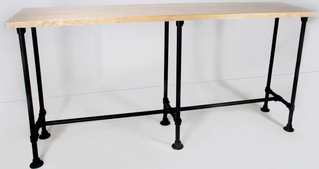
Optimizely Industrial Look by Formaspace