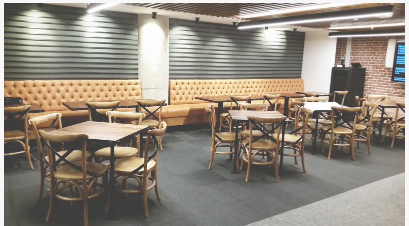
Twitter Cafe & Lounge by Formaspace