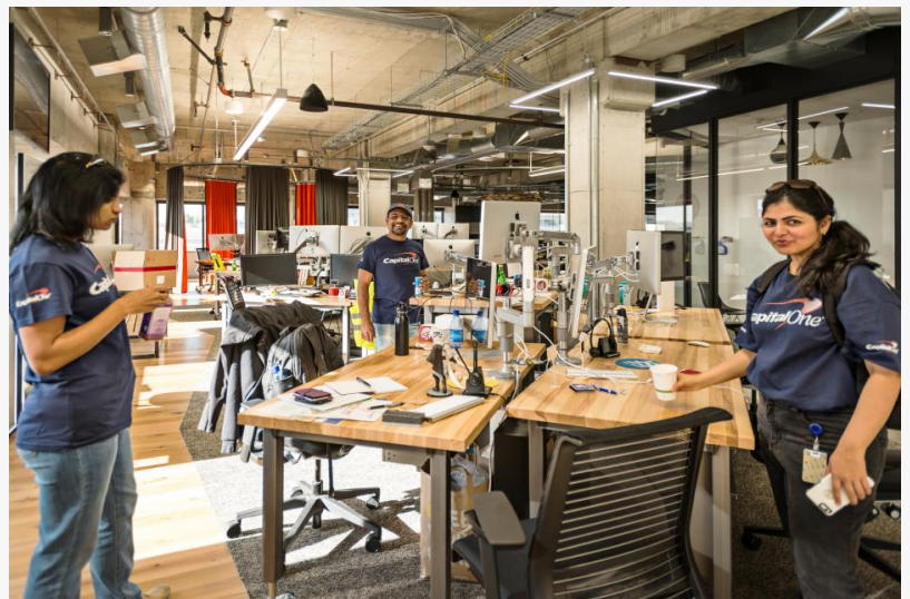
Capital One Headquarter - Manufactured by Formaspace

Furniture with this industrial look helps establish a sense of place and identity, whether at the office, in a retail environment, or in the home.