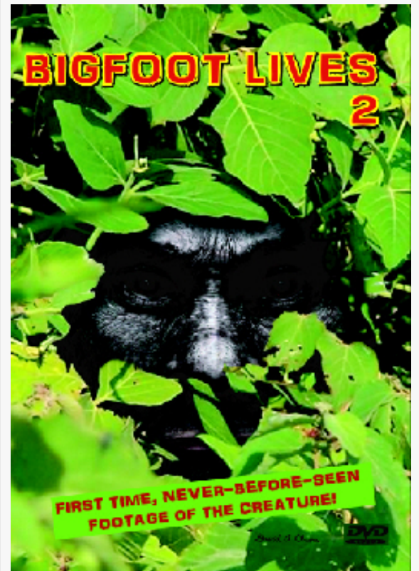
Another award winning documentary of the continuing search.