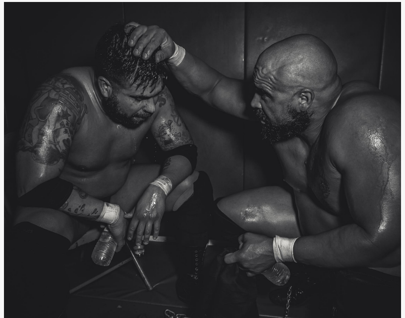
Keepers of the Faith - New PCW Tag Team Champions