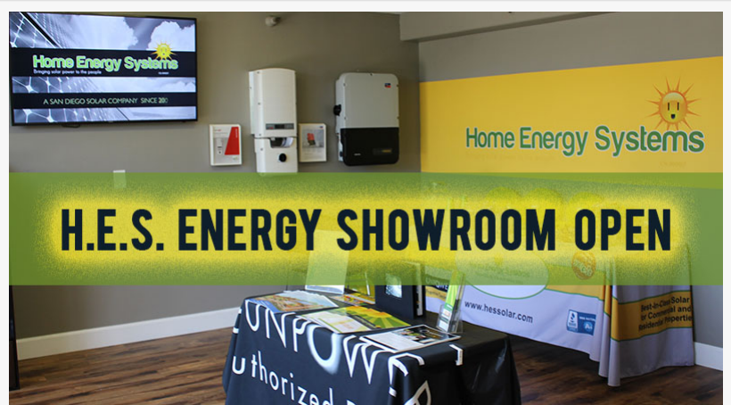
H.E.S. Energy Showroom & Design Center Now Open in Mission Valley East

Home Energy Systems plans to increase their total megawatts installed and taking an even higher ranking next year. With continued growth both within the company and the solar industry, H.E.S. Solar looks forward to another successful year and is honored to make it on the 2016 Top Solar Contractor list.