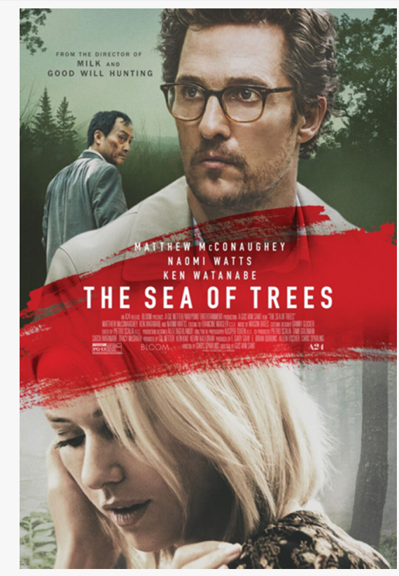
The Sea Of Trees with Matthew McConaughey

communities; to learn more visit: http://OMTimes.com