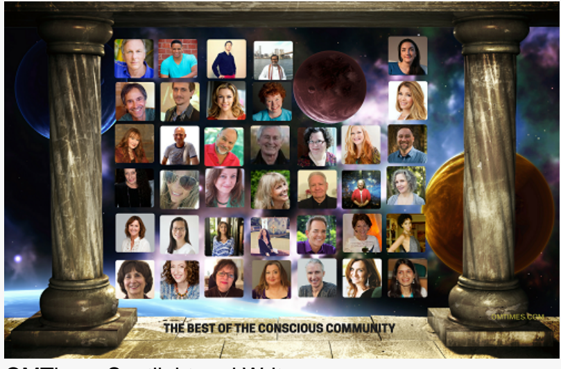
OMTimes Spotlight and Writers