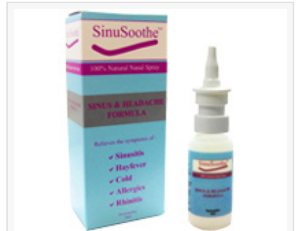
SinuSoothe Natural Nasal Spray

It can be caused by recurring bouts of acute sinusitis combined with a low immune system, the common cold, sinus allergies, nasal polyps or tumors, a deviated nasal septum, trauma to the face, and regular exposure to pollutants such as cigarette smoke. Less commonly it can be caused by medical conditions such as cystic fibrosis, gastroesophageal reflux, HIV and other immune system