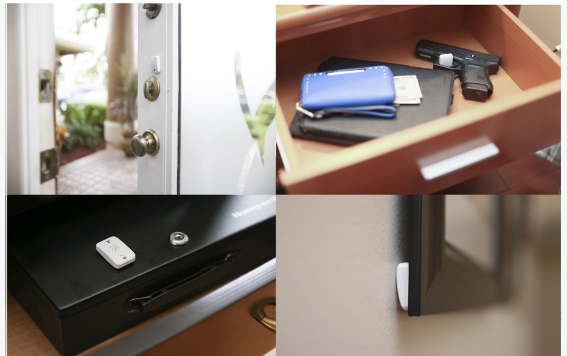
UMS HomeShield Monitoring anything