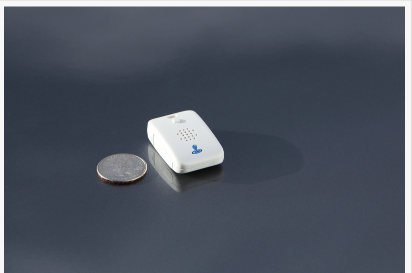
UMS HomeShield Smart Sensor

jon deng indagem tech 5615584578 email us here